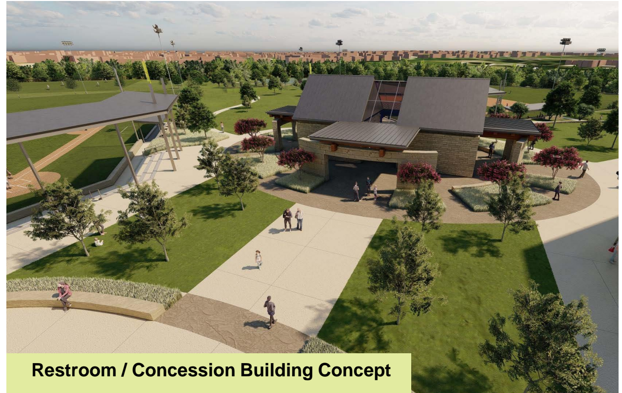
Restroom / Concession Building Concept